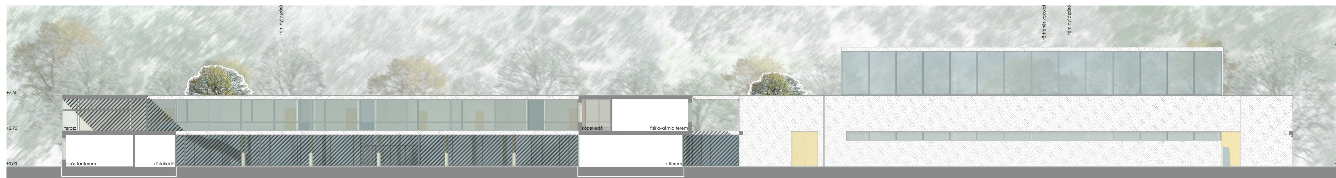
E - E METSZET M=1:200