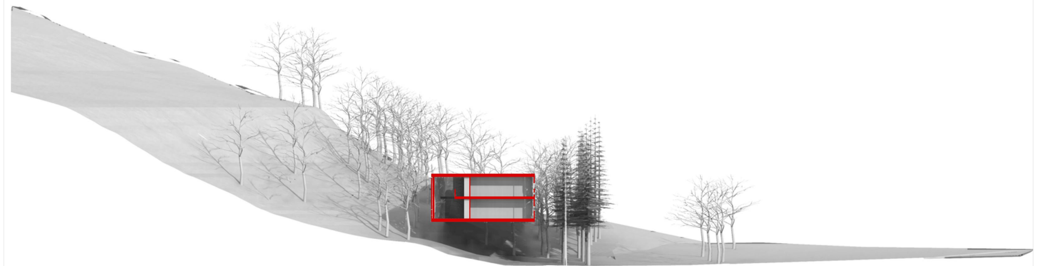
c-c metszet 1:200