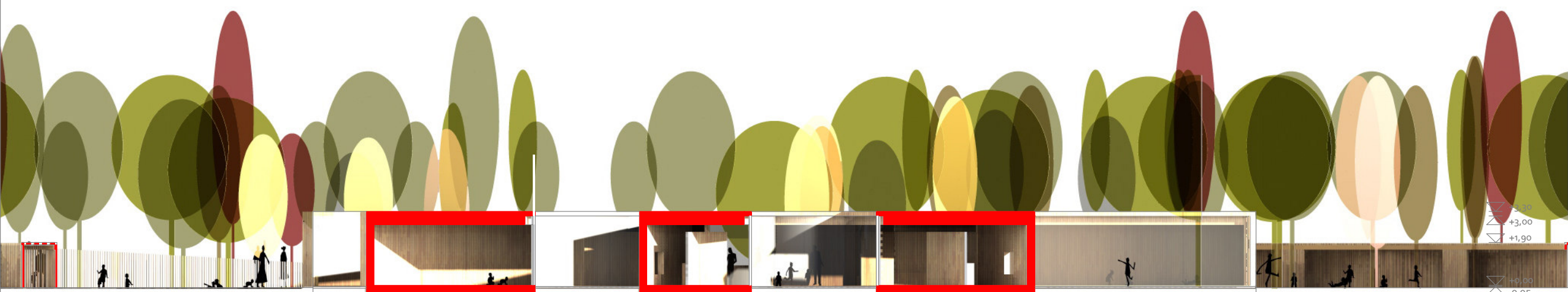
D-D metszet 1:200