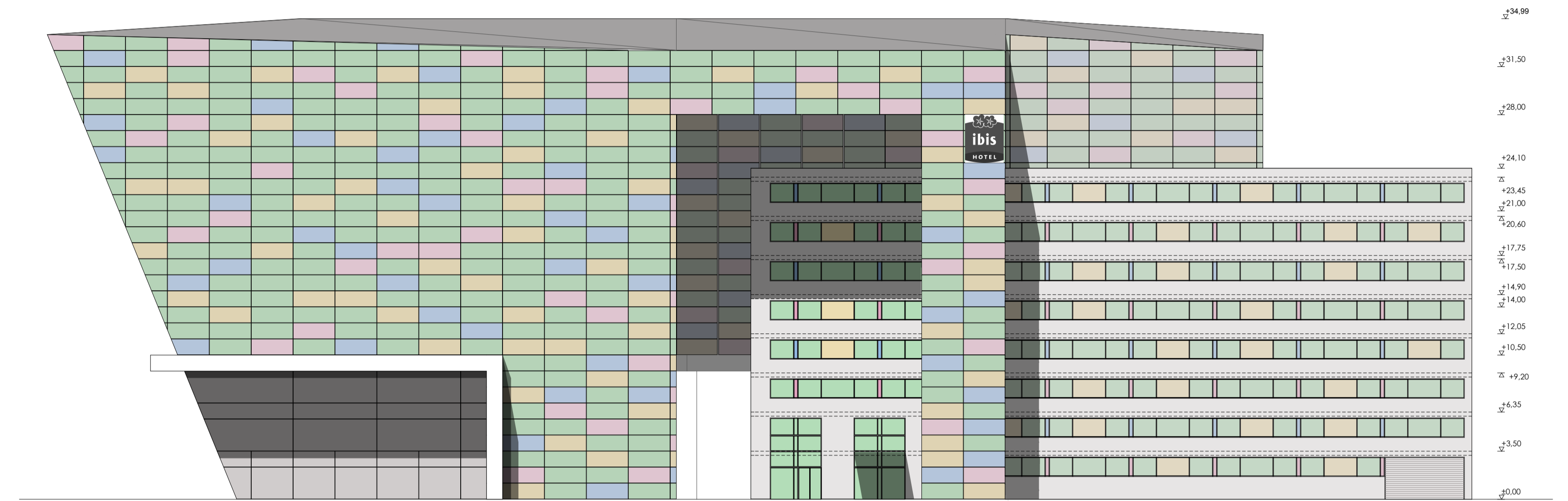
m = 1 : 250