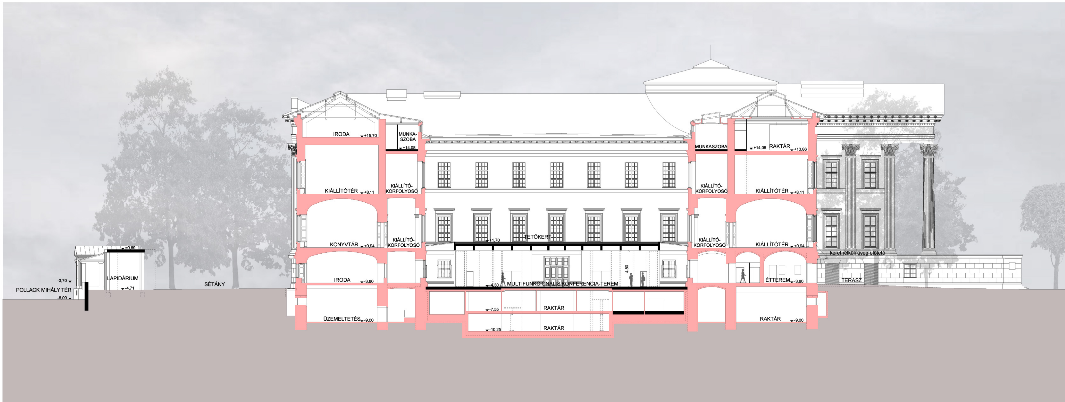
C-C metszet - m 1:250