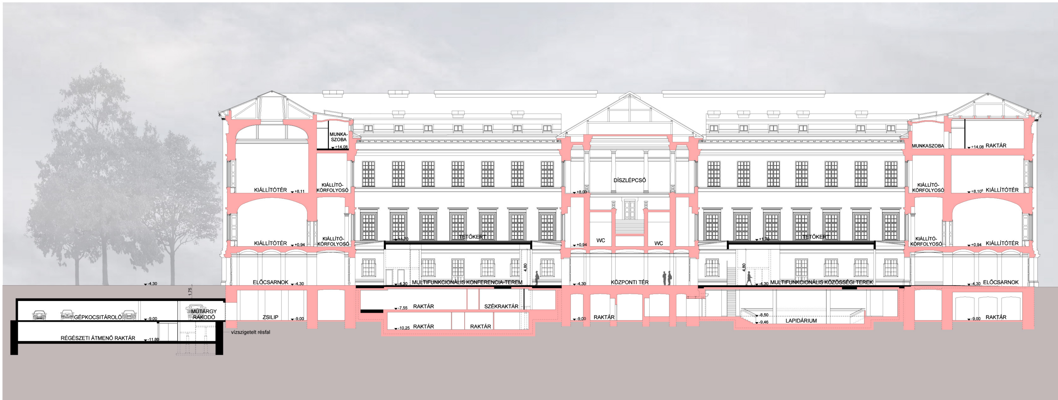
B-B metszet - m 1:250