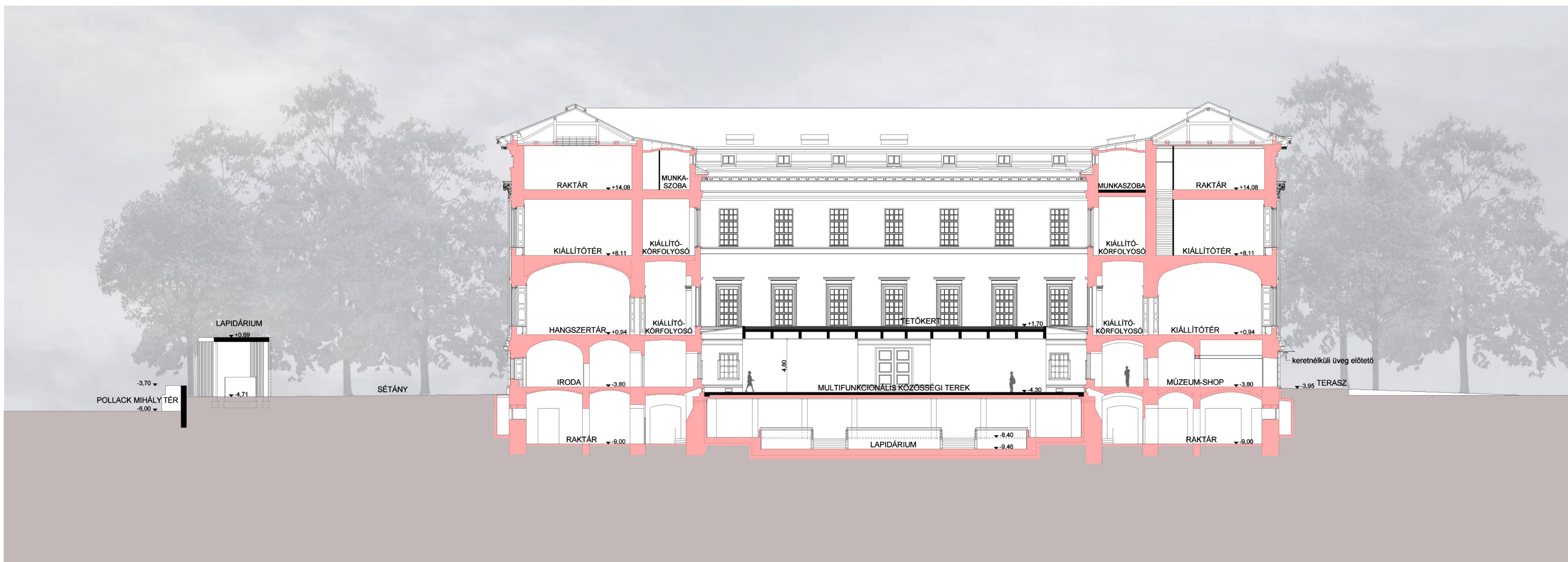
A-A metszet - m 1:250