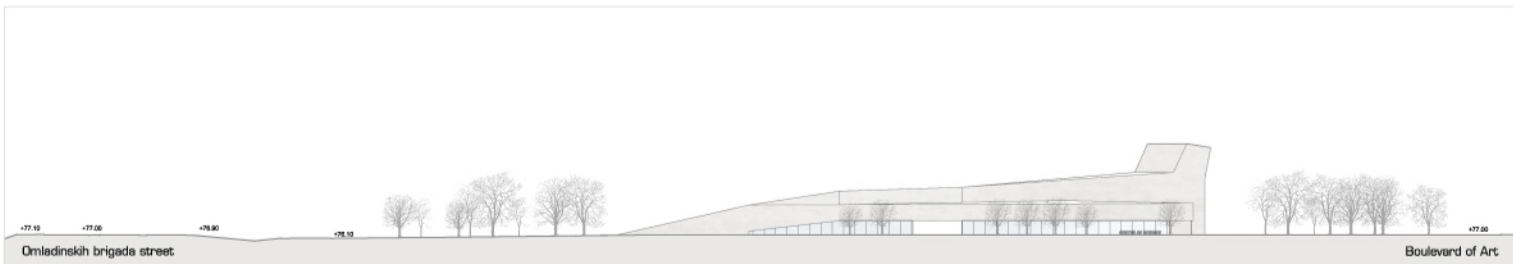
'1' SECTION SCALE 1:1000