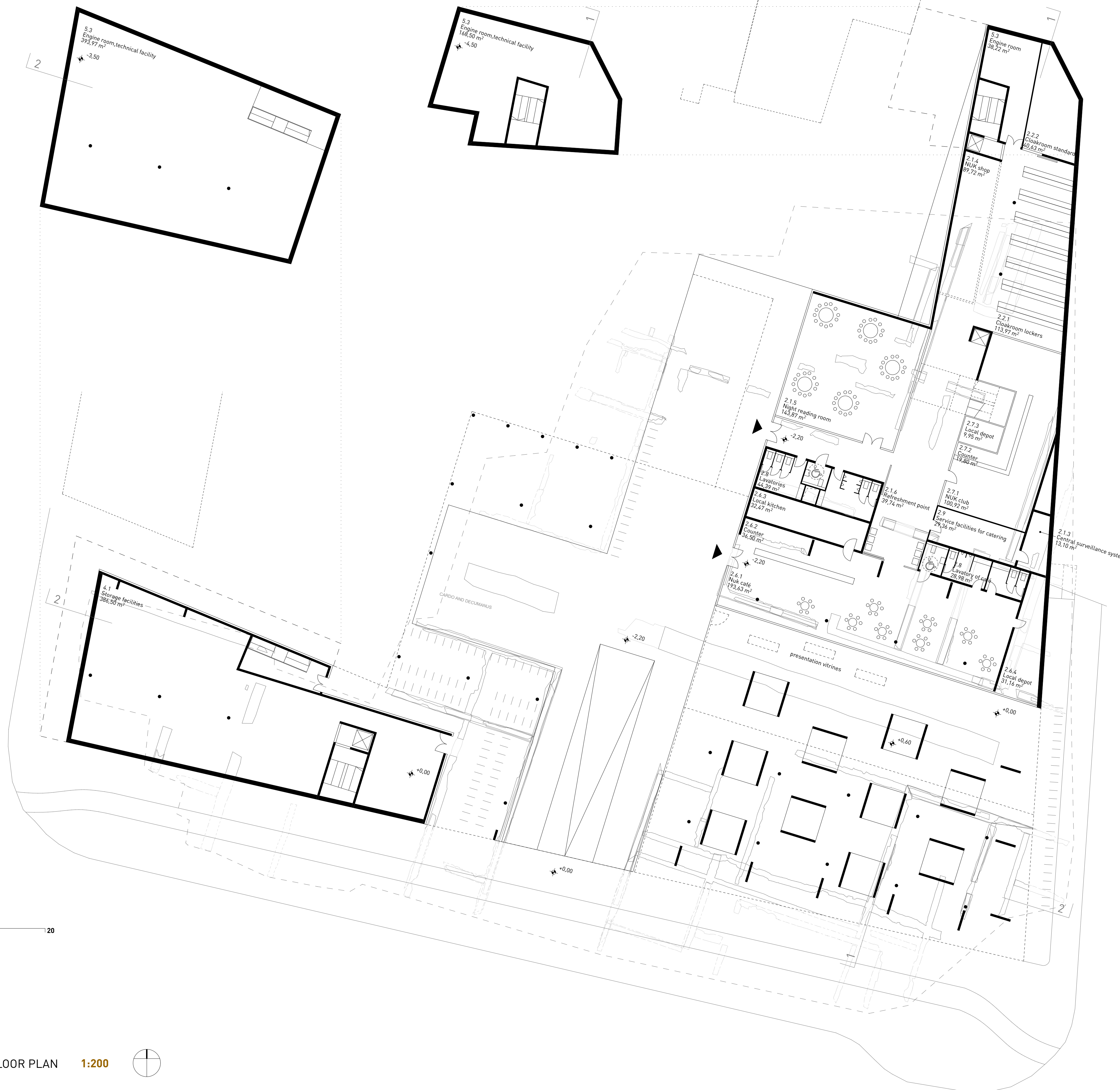
-2ND, -3RD FLOOR PLAN 1:200