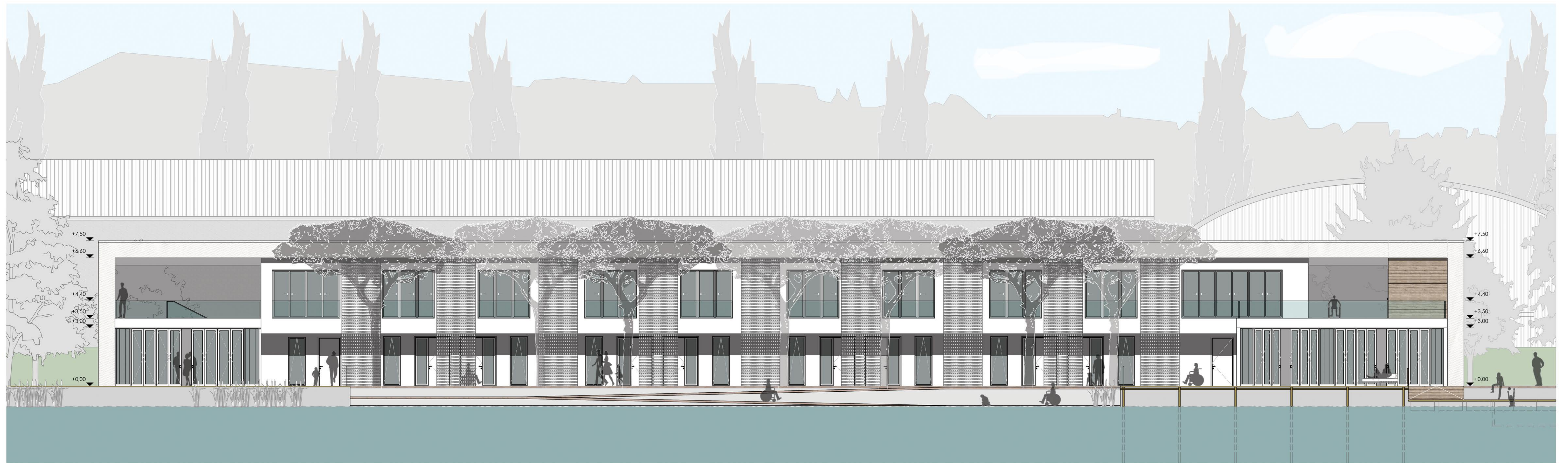
— D— Délkeleti homlokzat