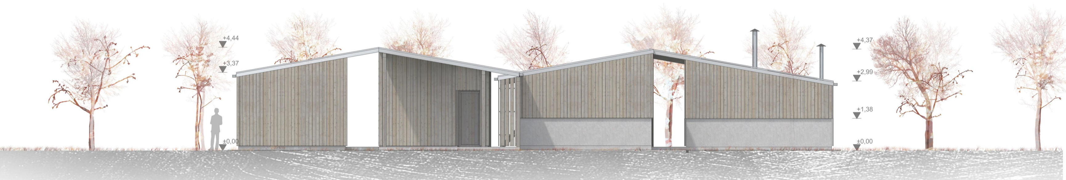
K HOMLOKZAT M=1:100