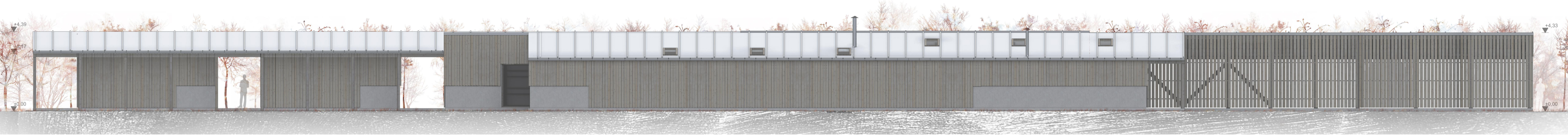
É HOMLOKZAT M=1:100