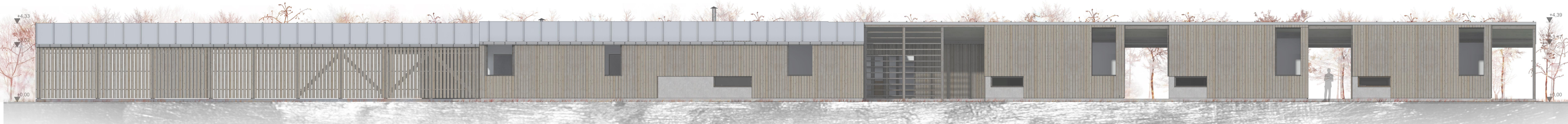
D HOMLOKZAT M=1:100