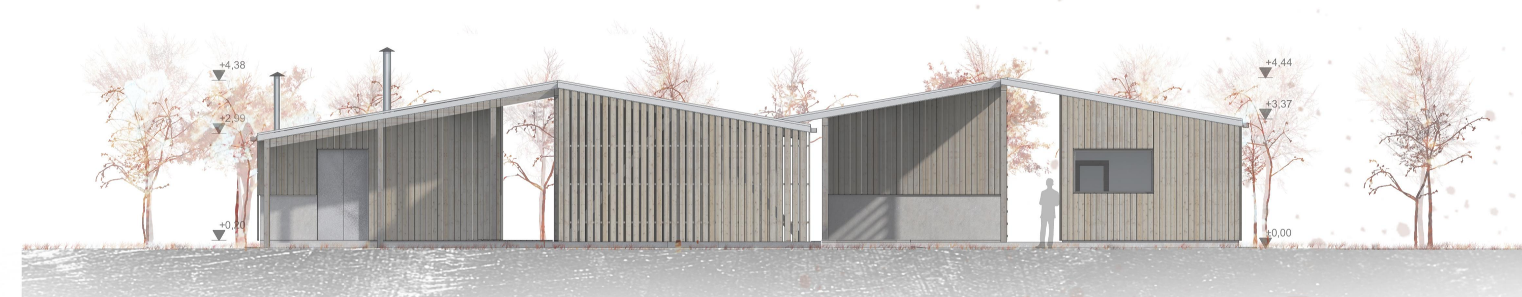
NY HOMLOKZAT M=1:100