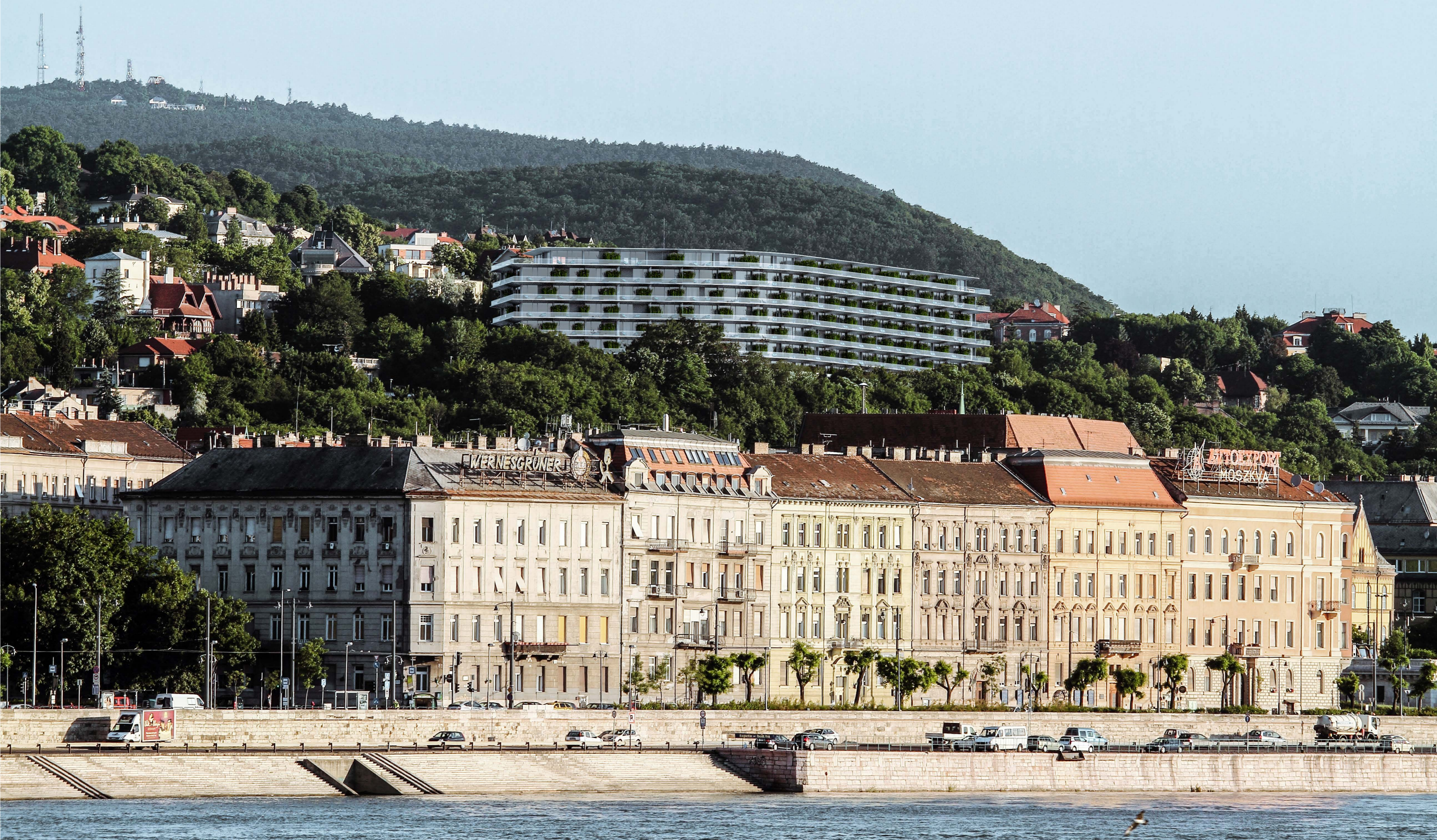
1. emeleti alaprajz m = 1: 250