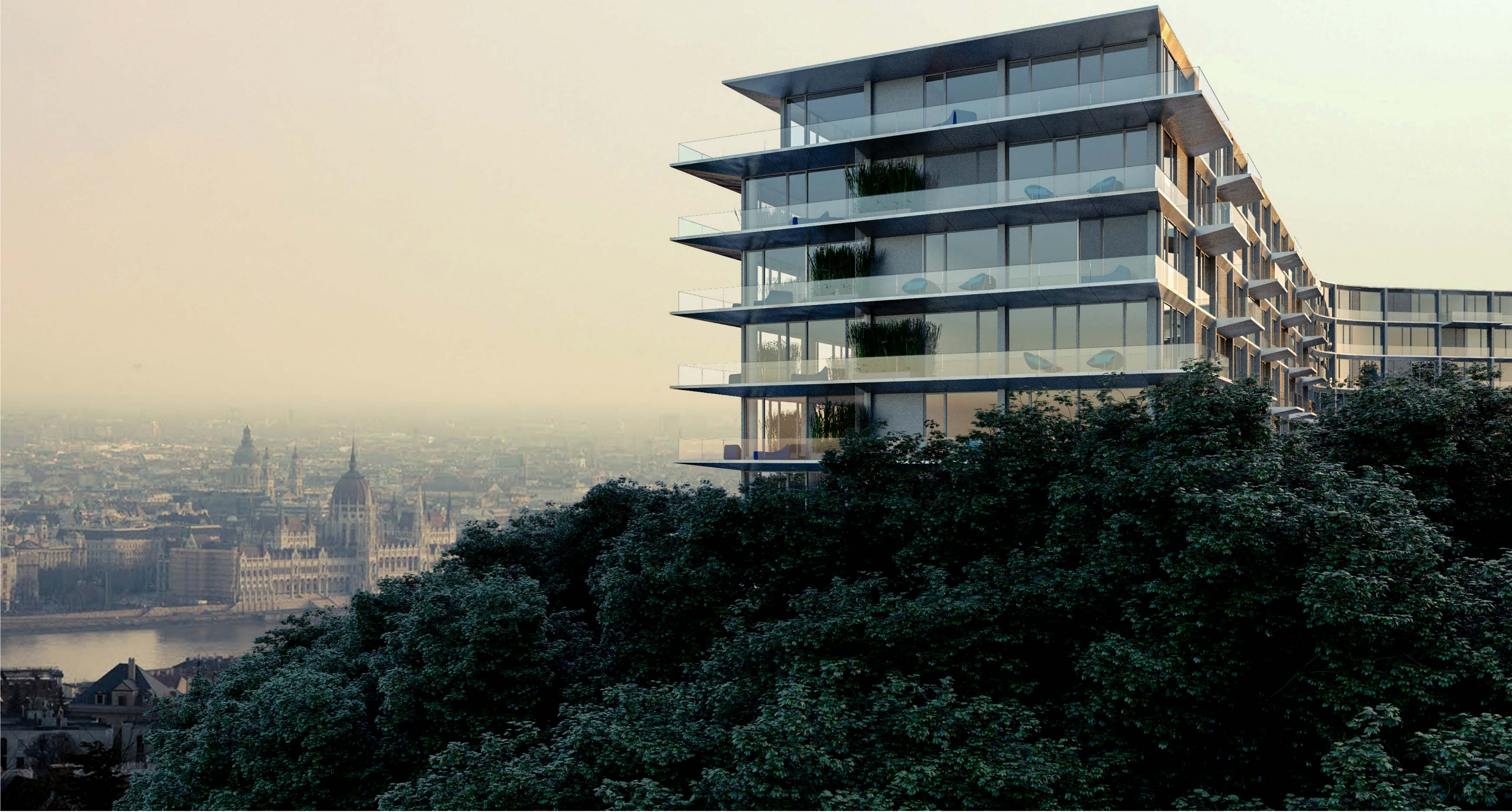
5. szint alaprajz m = 1: 250