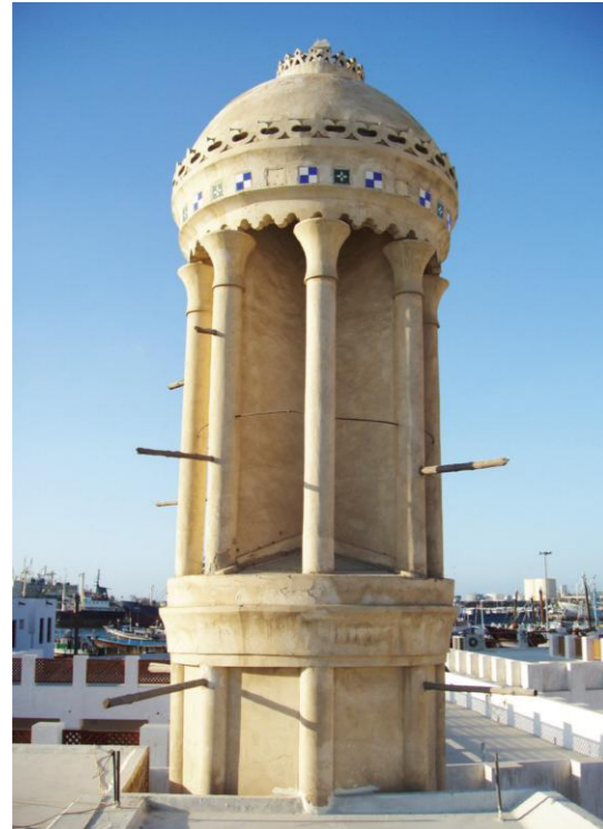
Windcatcher tower top