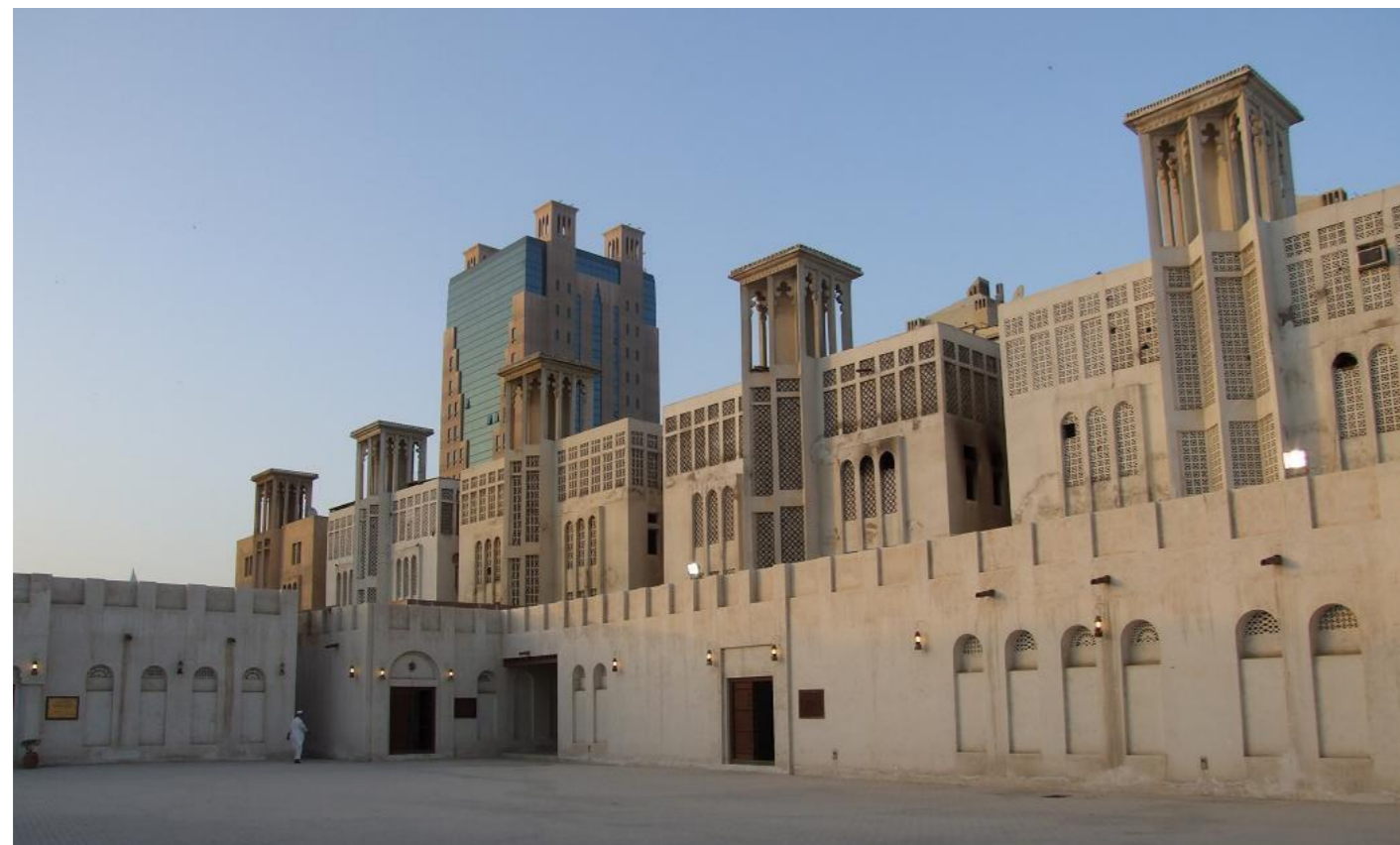
Traditional windcatchers on building