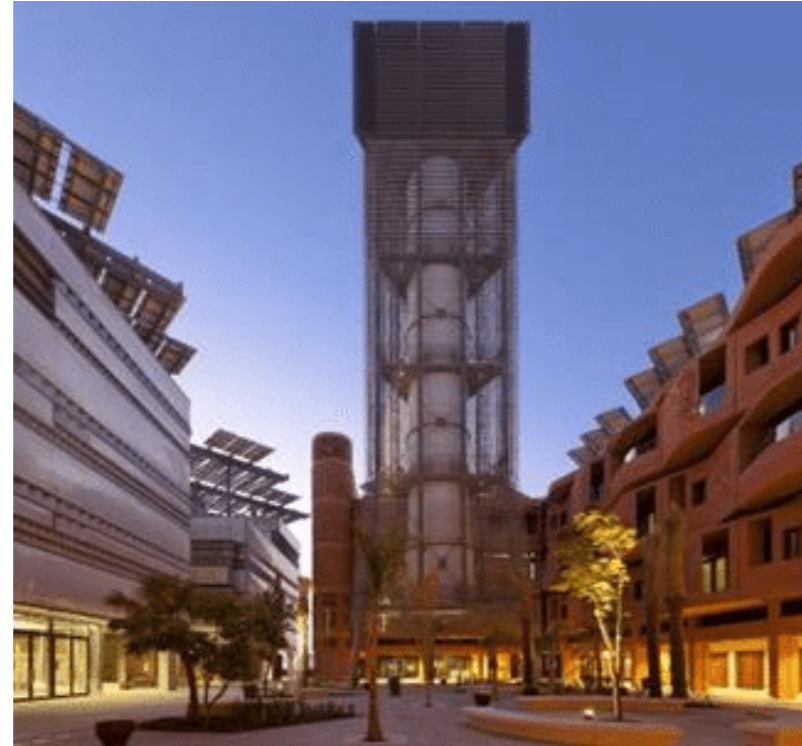
Modern high-tech windcatcher in Dubai