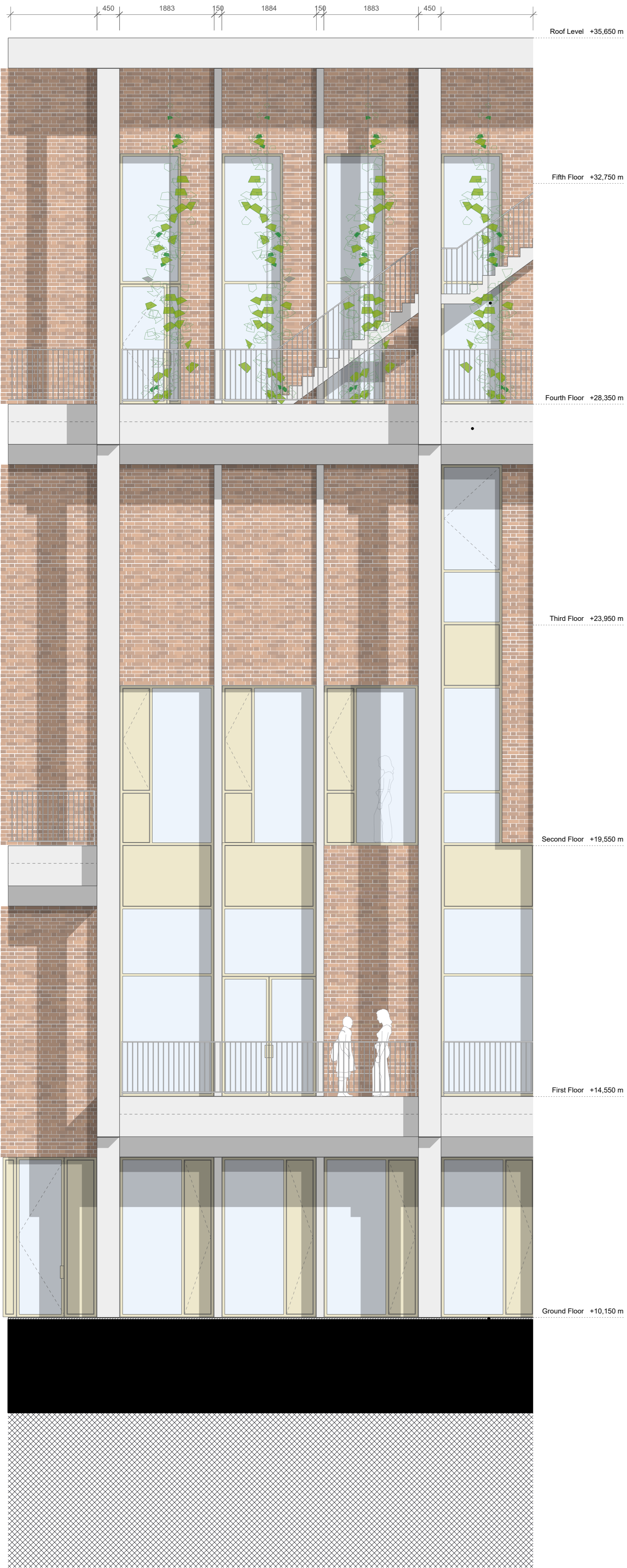
Proposed Facade Detail Of West Elevation & Colonnade