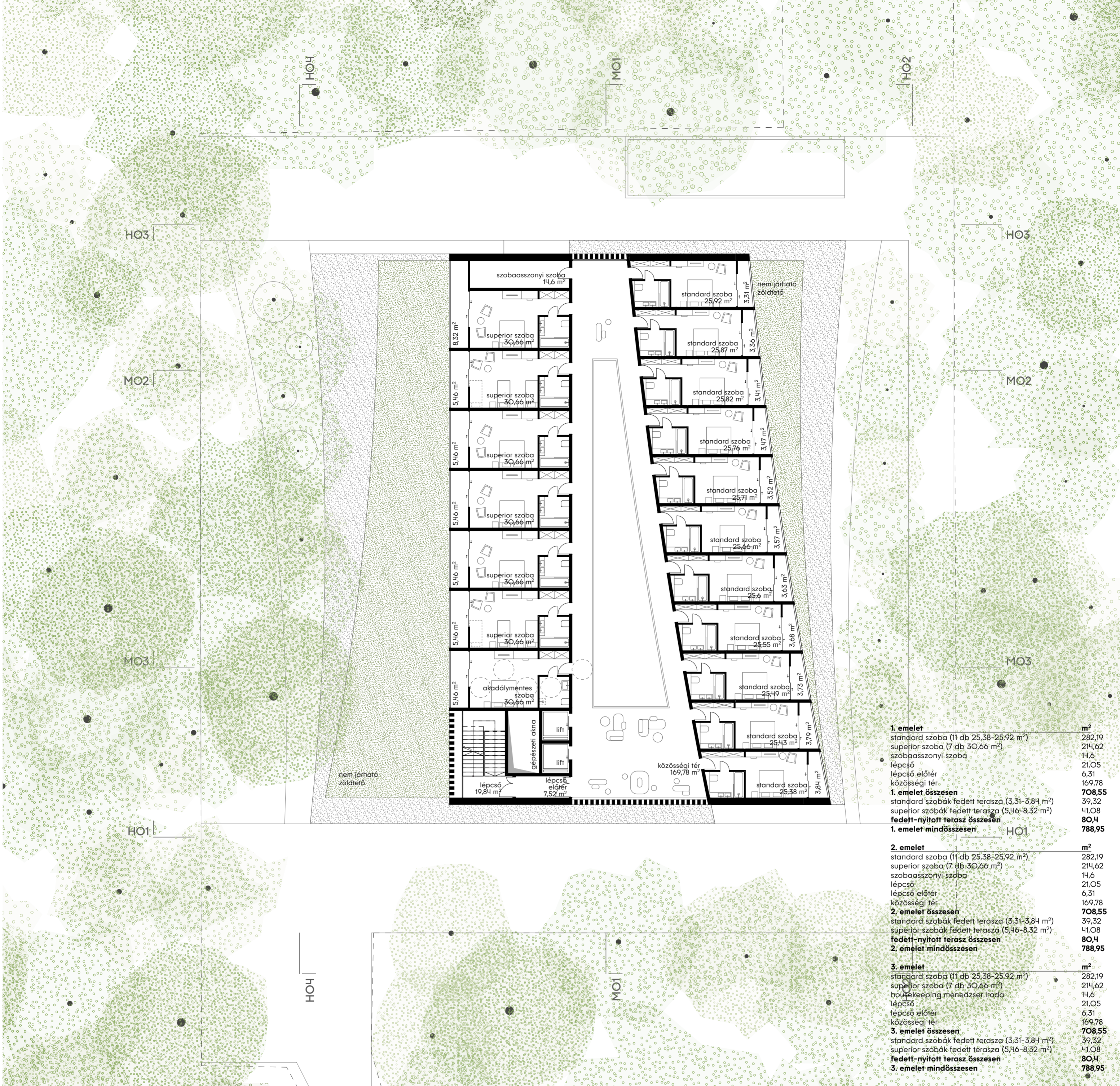
↑ 1-2-3. emeleti alaprajz - m 1:200