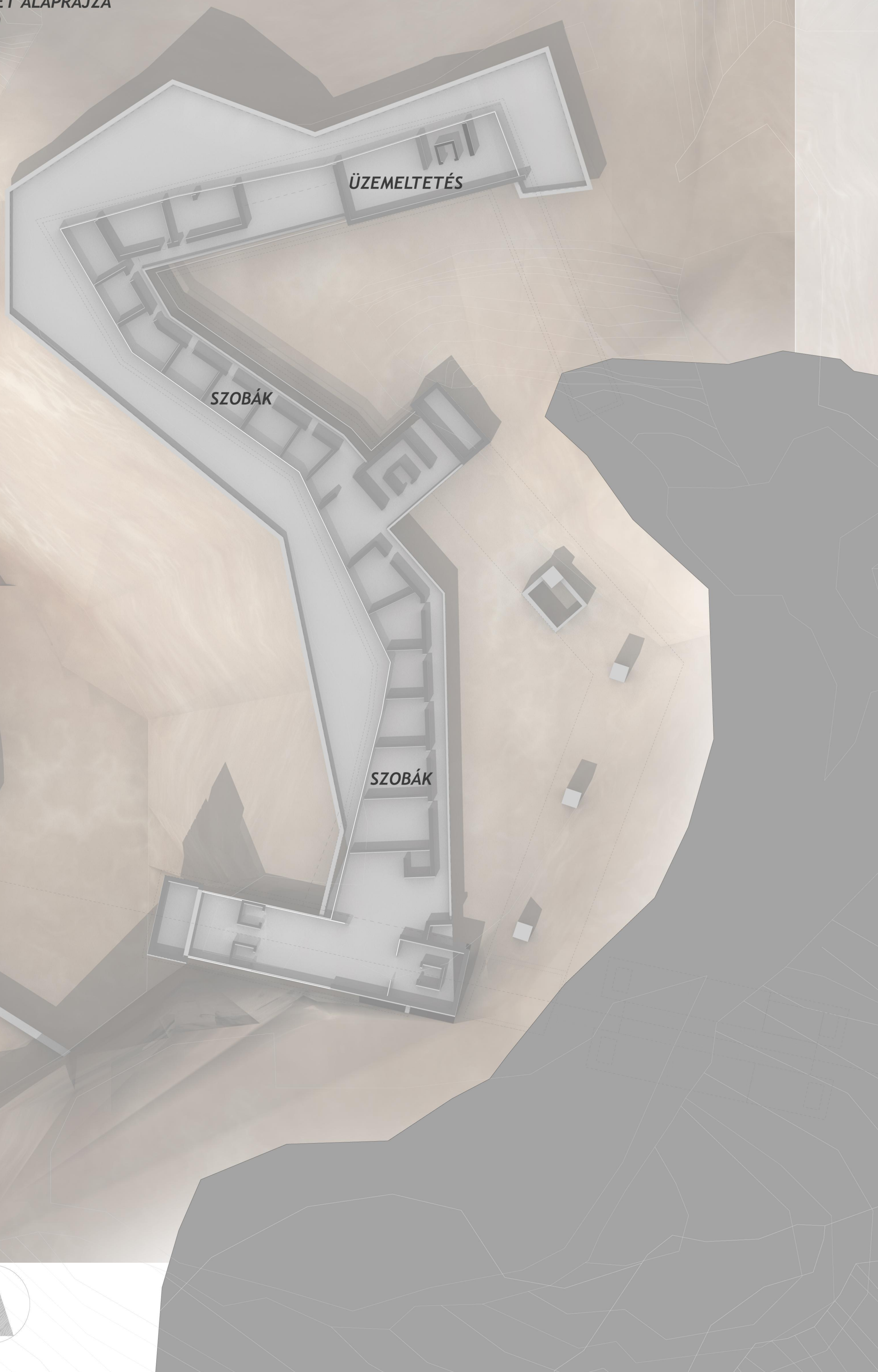
I. EMELET ALAPRAJZA M 1:250