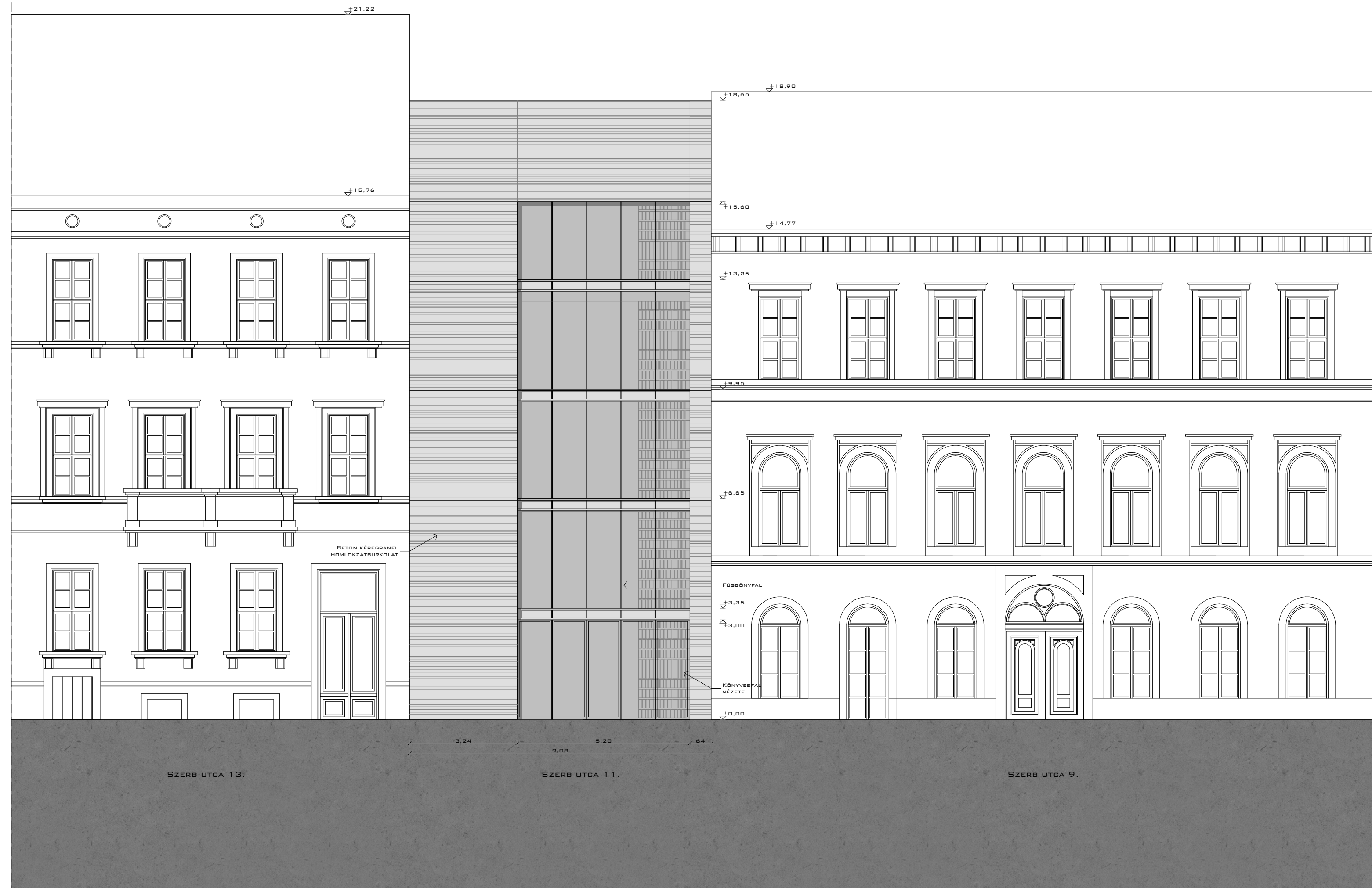
A-A METSZET [UTCAI HOMLOKZAT]