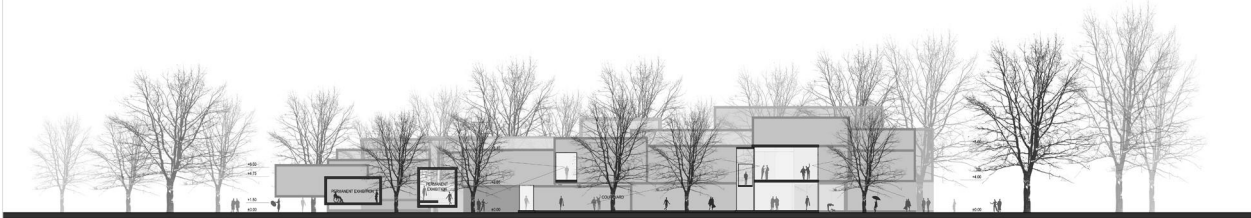
SECTION F-F 1/200