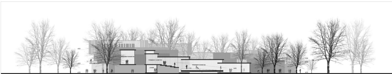
SECTION D-D 1/200