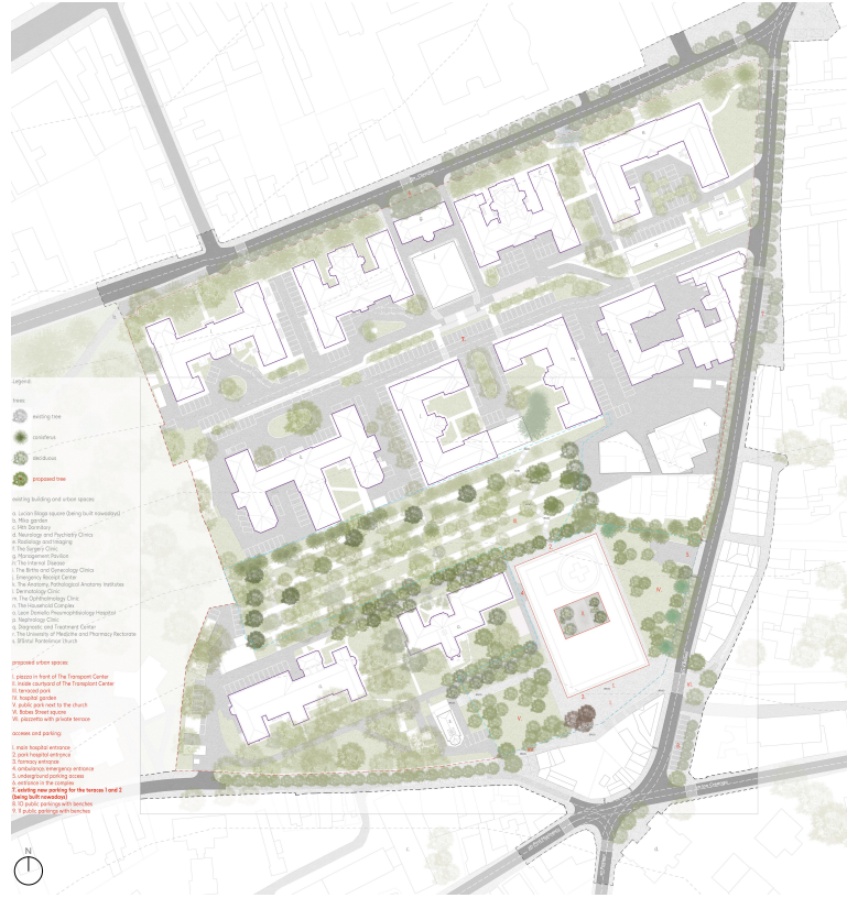
SITE PLAN scale 1:1000