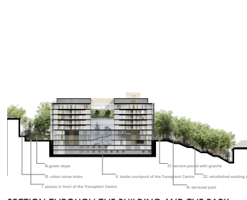
SECTION THROUGH THE BUILDING AND THE PARK scale 1:500