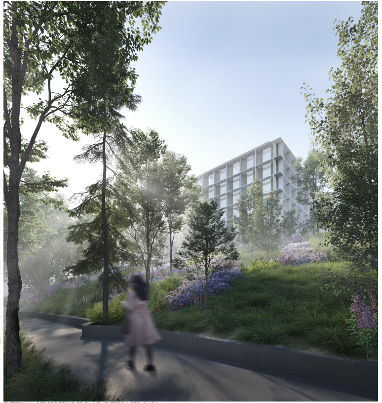
EXTERNAL PERSPECTIVE FROM THE TERRACED PARK