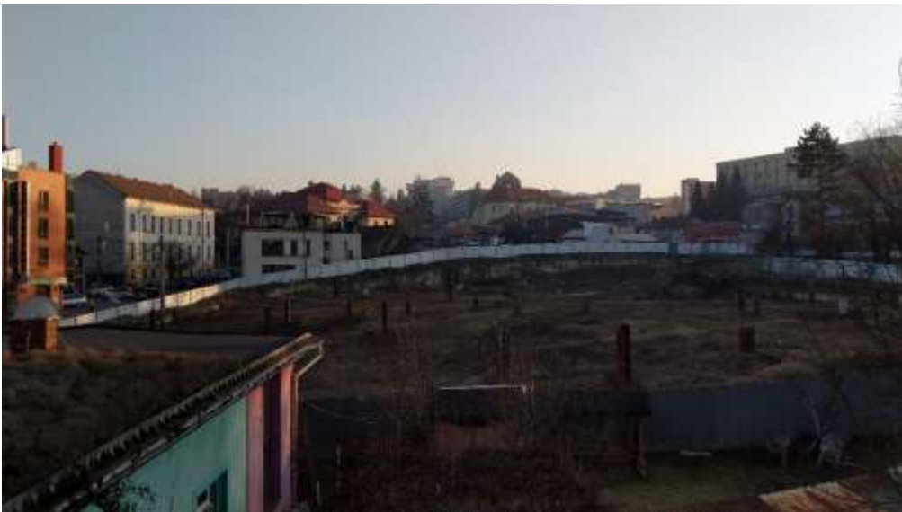
Figure 15 View of the site from the terrace of the Rector's Office of the University of Medicine and Pharmacy, towards Aleea Studenților and Victor Babeș Street (left)