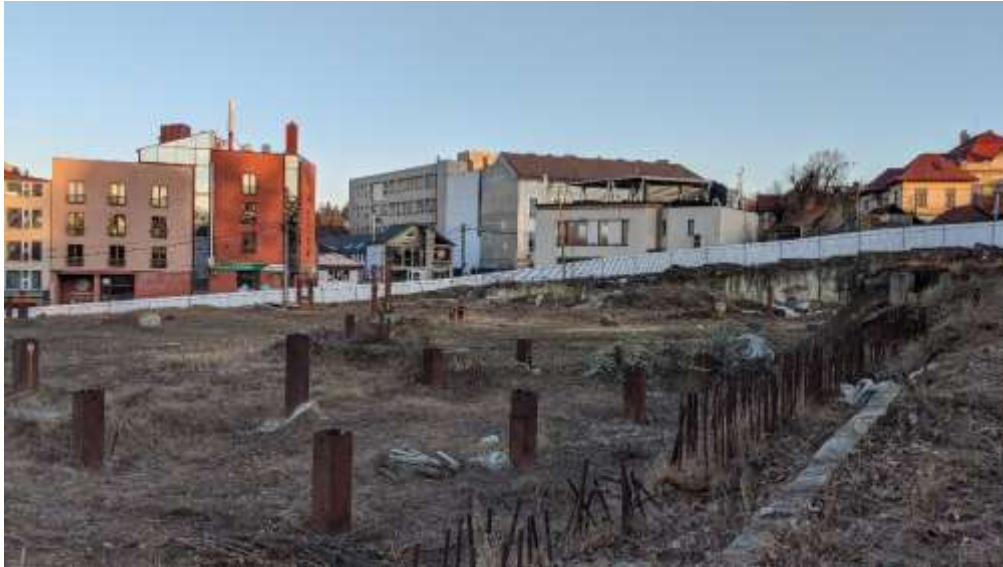
Figure 18 View from the site towards Aleea Studenților and Victor Babeș Street (left)