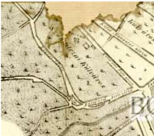
Figure 4 Location - extract from the map of 1860

The historical study presents a detailed evolution of all the plots delimited by the Clinicilor, Victor Babeș and B.P. Hașdeu Streets. The land on the eastern side of the hospital complex (the area between Victor Babeș Street) resulted from operations of merging the existing plots in the second half of the 19th century. The plot that is the object of the competition seems to be composed approximately of the former lands registered at no. 6-20 related to Felső Szén street (currently Victor Babeș Street), as well as to those from no. 1-7 and partially 9 from Kökert Street (now B.P. Hașdeu). 1