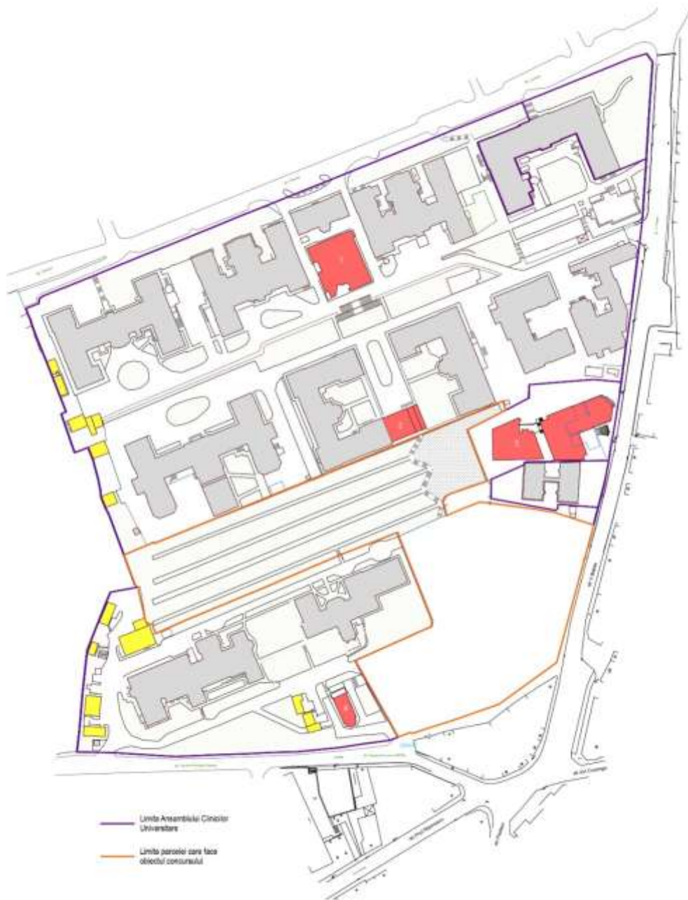
Figure7 University Hospital Complex—current situation