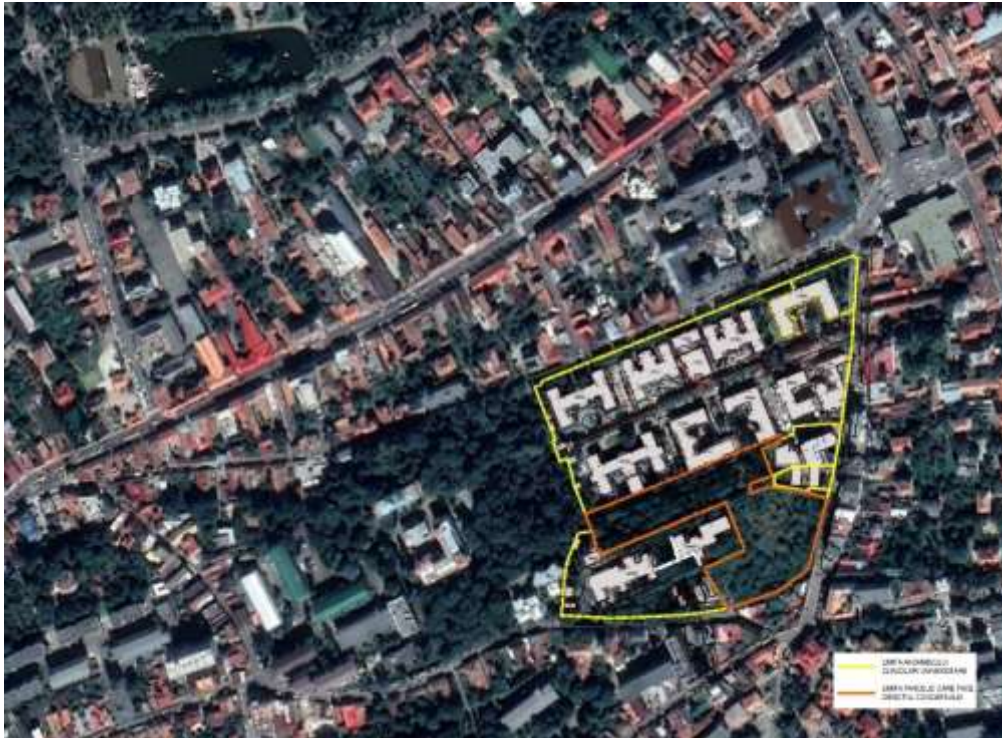
Figure1 Site layout plan

The plot is delimited on the north and west sides by the University Hospital Complex, a historical monument of class A, LMI CJ-II-a-A-07297, which is owned by the County of Cluj and under the administration of the Cluj-Napoca County Emergency Clinical Hospital. On the east side, the plot is delimited by Victor Babeș street, and on the south side by Aleea Studenților (see Figure1 ).