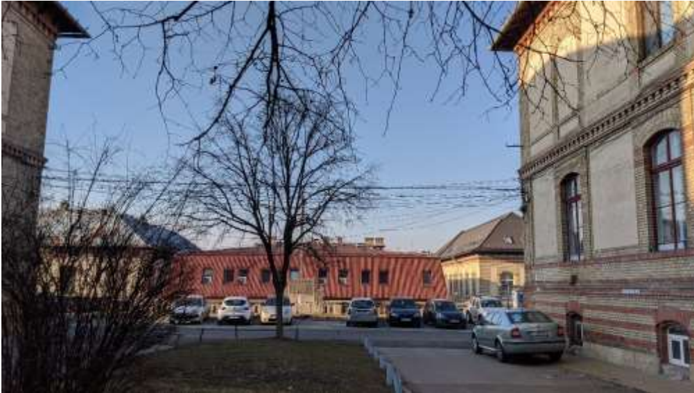
Figure 8 Perspective from terrace II to terrace I (Emergency Department insertion in the background)