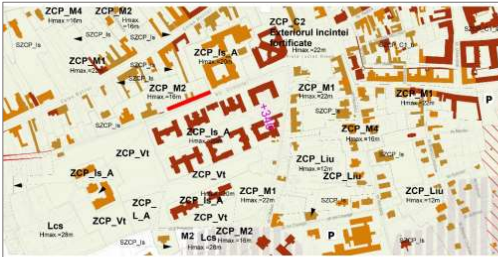
Figure 13 Reference Territorial Units – extract from the General Urban Plan of Cluj-Napoca

According to the provisions of the Urban Planning Certificateno. 3530 / 19.07.2017, for the detailed regulation of all these areas it will be necessary to elaborate a Zonal Urban Plan for Protected Built Areas. This stage is part of the services that will be contracted after the competition has taken place.