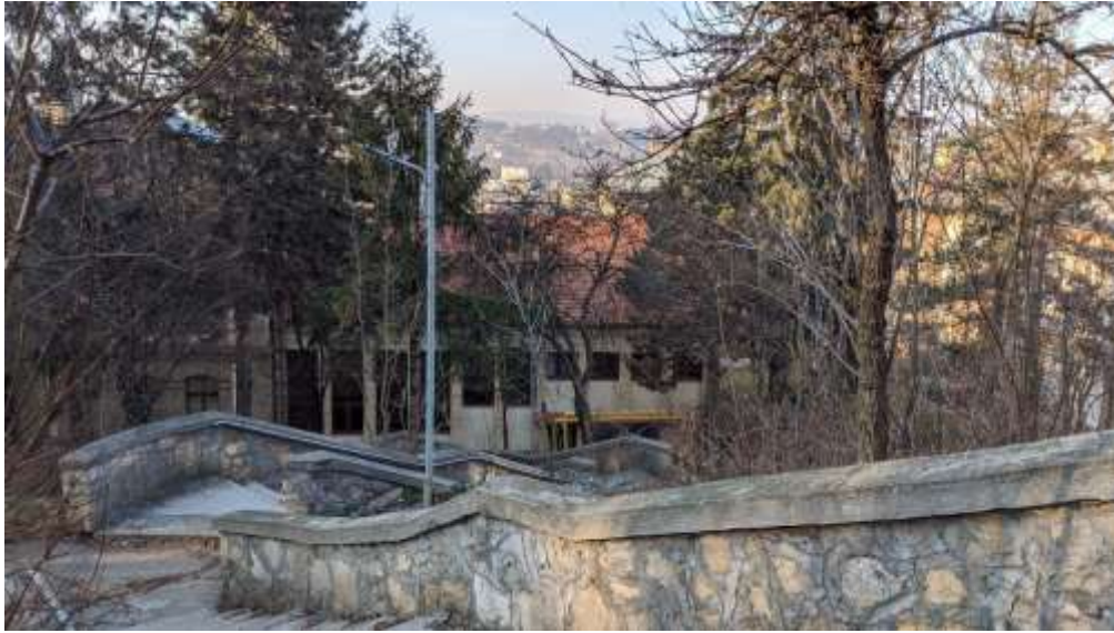
Figure10 Park – access staircase between the terraces II and III of the University Hospital Complex (in the background – The Dermatology Clinic)