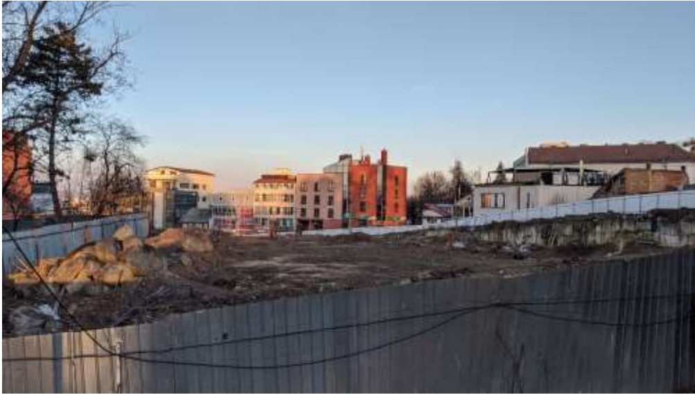
Figure 14 View of the site from the courtyard of the Leon Daniello Pulmonology and Phthisiology Hospital, towards Victor Babeș Street and Aleea Studenților (right)