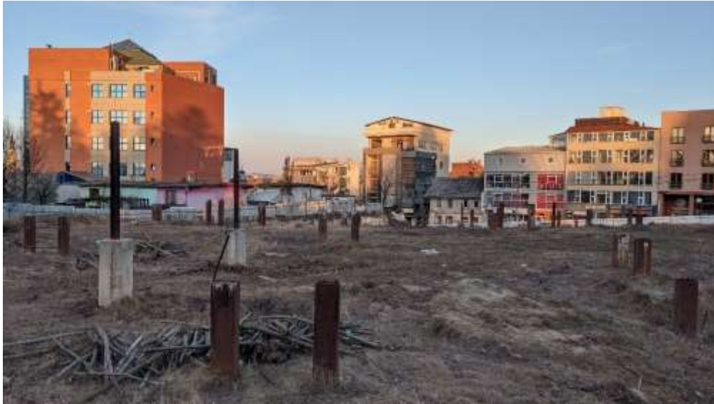
Figure16 The existing structure on the site – view towards Victor Babeș Street