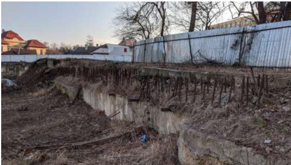
Figure 19 View from the site towards Aleea Studenților (background) and Leon Daniello Hospital (right)