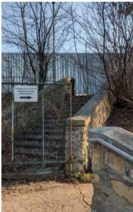
Figure12 The relationship between the park and the site