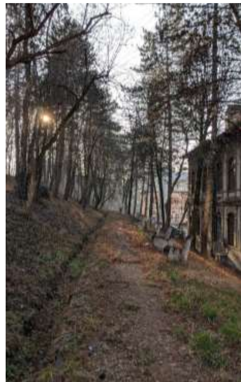
Figure11 The current arrangement level of the park