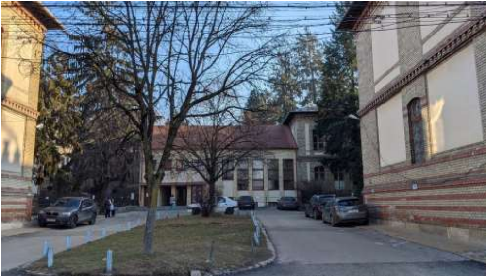
Figure 9 Perspective from terrace II to the park (extension of the Dermatology Clinic in the background)