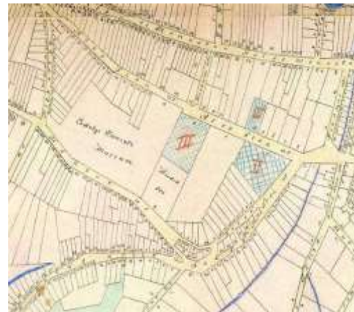
Figure 3 Location – extract from the map of 1869