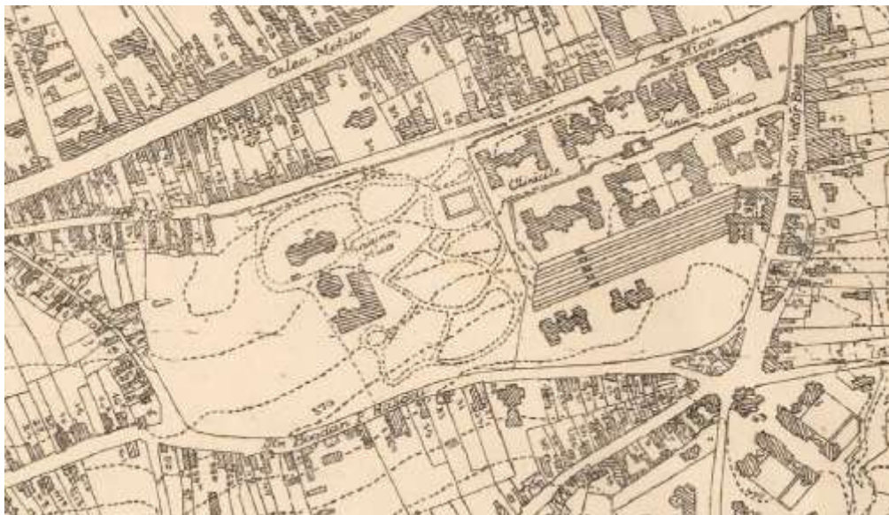
Figure5 Arrangement of the clinics on the three terraces, 1937 2

The three terraces of the complex descend from the B.P. Hașdeu and Victor Babeș Streets towards Clinicilor Street. The first two terraces developed relatively simultaneously, between 1886 - 1900, covering most of the hospital wings. The third terrace was developed in two stages, between 1900-1908. The layout of the buildings on the three terraces, as well as the building stages of the whole Complex are detailed in Table1 and Table2 , respectively in Figure6 and Figure5 .