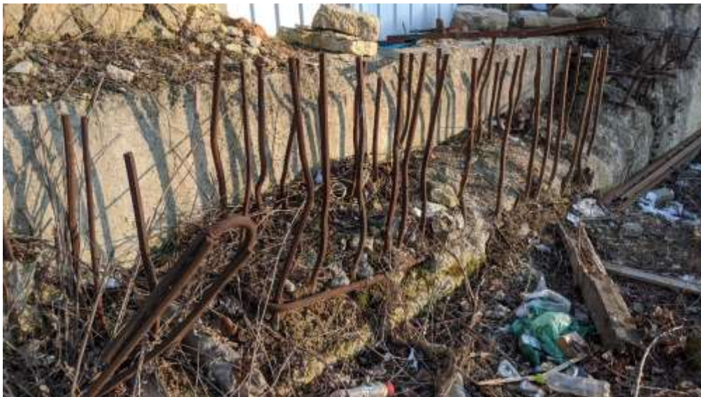
Figure17 Perimeter wall – visible reinforcement